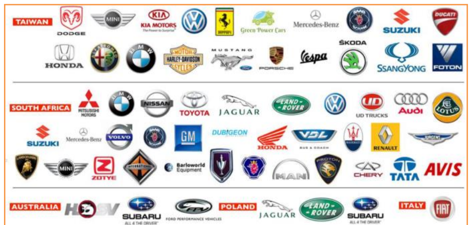
Exhibit 4: DataDotDNA OEM Customers - International

It is practically infeasible, for instance, to remove the thousands of microdots applied to a vehicle while just one dot is sufficient for correct identification. The launch of the CopDots program in the US and the endorsement of the technology by the police underscores the effectiveness of DataDotDNA.