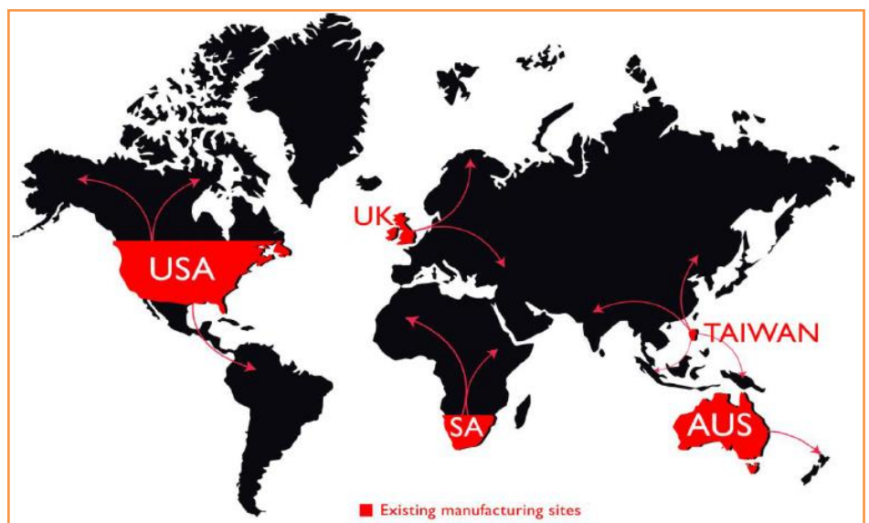
Exhibit 5: Presence across 20 geographies and manufacturing in five

The Company will also look to cross sell other technologies, such as DataTraceDNA to existing relationships in alcohol, tobacco, pharmaceutical, automotive and spectacle frame industries. These efforts are likely to bear fruits in the near term.