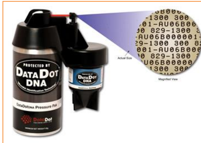
Exhibit 1: DataDotDNA Technology

DataDotDNA is a security identification system that utilizes DataDots or microdots to protect property from theft. The microdots are tiny microscopic discs containing a code unique to the property or owner. As small as a grain of sand, this technology is recognized as one of the most effective ways to counter theft and play a crucial role in identification and recovery of stolen goods. The unique code that is etched on the microdot is stored in the Company's worldwide verification database called DataBaseDNA.