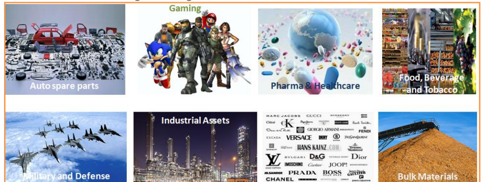
Exhibit 3: DataTraceDNA growth segments