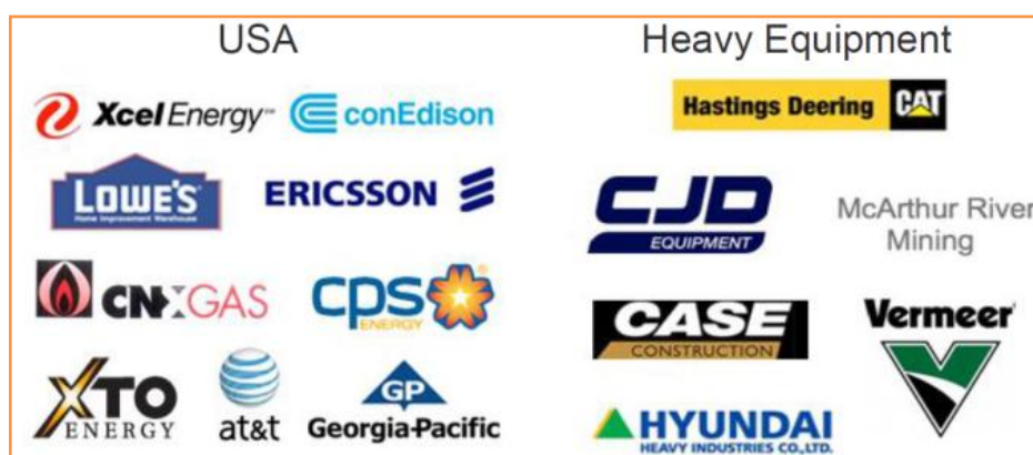
Exhibit 6: Key commercial clients

ConEd provides utility services, electric, gas and steam to more than three million customers in New York City and Westchester County, New York. ConEd had reported 155 thefts of copper cable from manholes, trucks or other company facilities. ConEd engaged DDT to use its DataDotDNA spray system that leaves microdots on the copper or equipment. Each dot contains a unique identifier, logo or numbered ID that is invisible to the naked eye but can be viewed with a UV light.